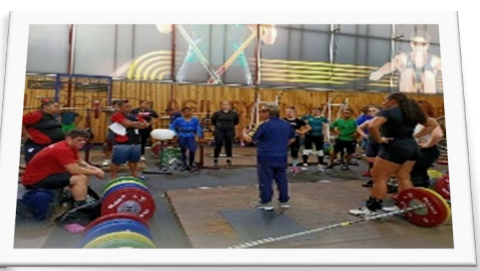
Lifters trained twice per day at the Australian Institute of Sports in Canberra and at all times supervised by appointed coaches