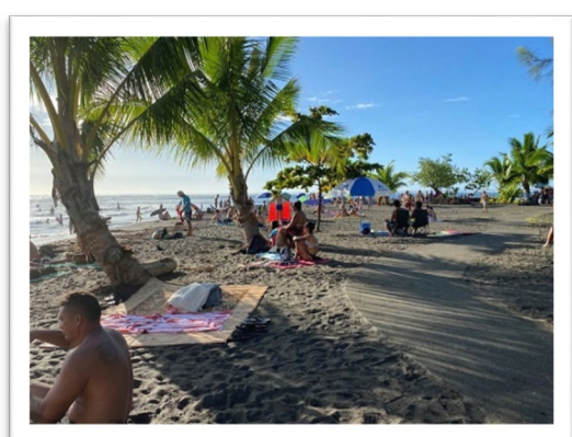
Tahiti beautiful black sand beach