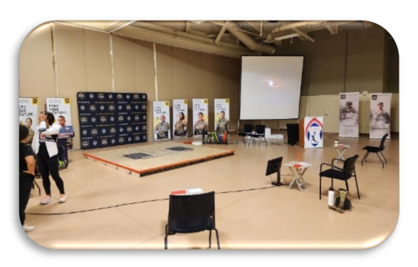
The set up during the International tournament held in Guam between Palau, Northern Marianas and Guam in the month of February