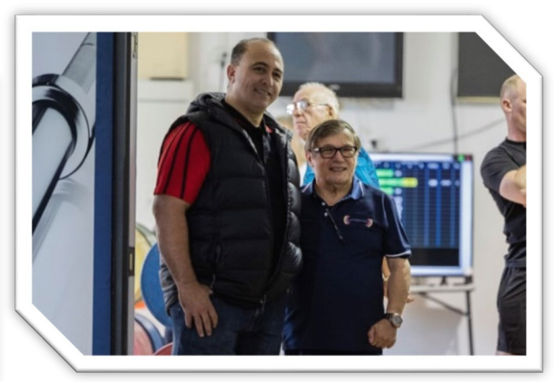
The gym in Dromana Melbourne.