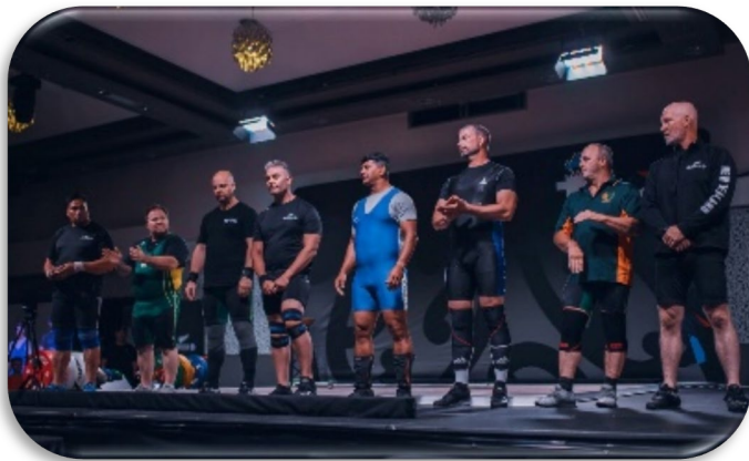
The stage in New Zealand at the 2023 Masters World Cup