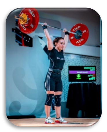
Lifters and officials attending the 2023 Masters World Cup held in Auckland -New Zealand in the month of March